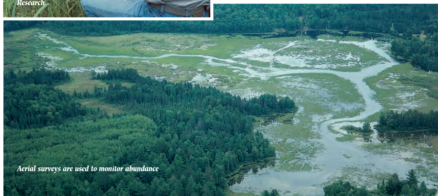
Aerial surveys are used to monitor abundance