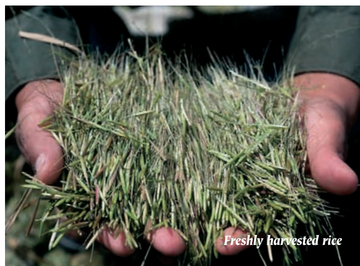
Freshly harvested rice

A ricing trip may yield anywhere from a few pounds of rice to more than 200! But since even intensive hand harvesting removes only about 15% of the annual yield, abundant seed remains for wildlife and to reseed the bed.