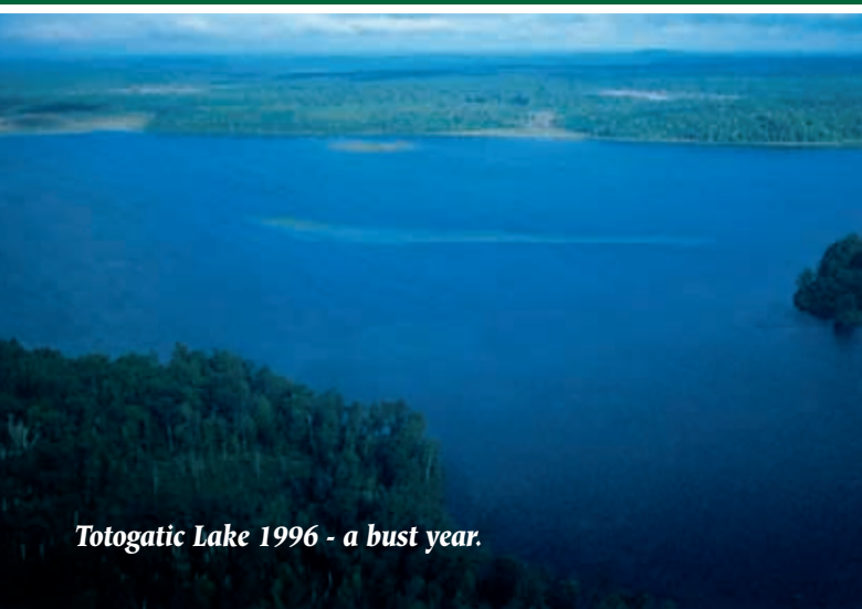
Totogatic Lake 1996 - a bust year.

W ild rice is an annual aquatic grass. Its life cycle is fairly simple: The seed drops off the plant in August or September and usually sinks rapidly into the sediment near the mother plant. The seed remains dormant in the mud until spring when warming water and low oxygen conditions stimulate germination. Although most seed will usually germinate the first spring, some may remain dormant for five or more years. This extended dormancy allows wild rice to survive occasional crop failure.