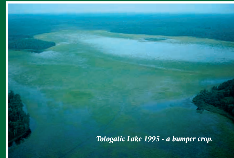
Totogatic Lake 1995 - a bumper crop.

Rice abundance can vary widely from year to year, especially on the most "lake-like" beds. The rule-of-thumb for lake beds: A typical four year period will include a bumper year, two fair years, and a bust (see photos left and right). 🌱